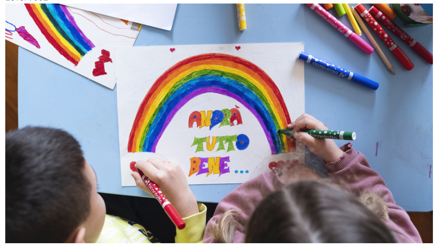
Image 1. Children draw a rainbow and the slogan of hope being shared in Italy, "Andrà tutto bene" (Everything will be alright), during quarantine measures amid the novel coronavirus COVID-19 pandemic on March 13, 2020, in Milan, Italy.

By Washington Post, adapted by Newsela staff on 03.25.20 Word Count 772 Level 700L